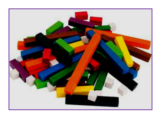
Figure 1. Colored Cuisenaire rods

Language can viewed as set of sounds arbitrarily which can be connected to particular meanings and be organized into sentences or strings of meaningful unit by utilizing grammatical rule. Thus, in the EFL learning the first grade students of MTS Mifatahul Ulum, amount eighteen students, initially needs to be brought in regarding the sounds of the EFL (such as: pronouncing the sounds 'the red rod') in the classroom before they understand the meanings of the sounds in order that they are more prepared to learn the EFL as their target language. To implement the SWM, the tutor employed the colored Cuisenaire rods made from small blocks of wood with the different color and varying size (see Figure 1) as the physical object of EFL teaching.